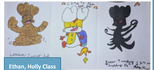
Ethan, Holly Class