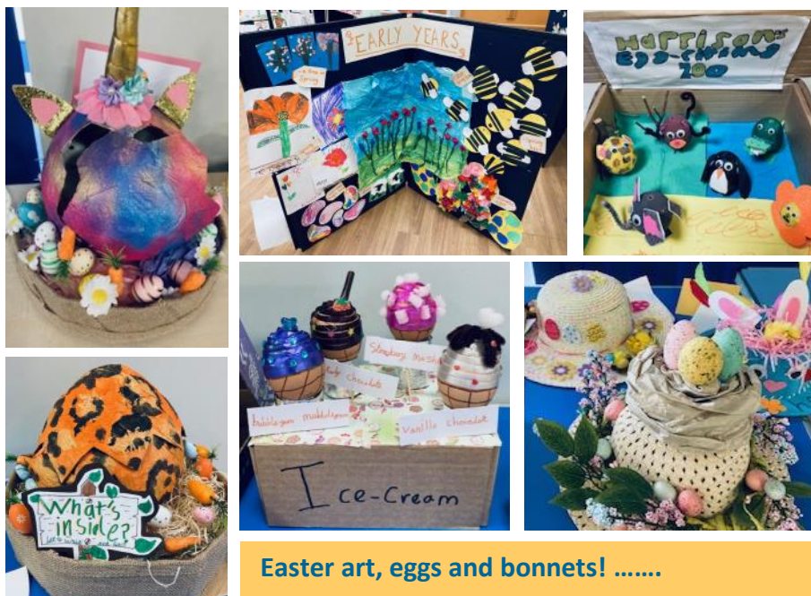
Easter art, eggs and bonnets! .....

Also, a special mention to the whole of Year 4 for doing so well with their intensive swimming course over the past few weeks. They have all made great progress and have represented the school brilliantly .